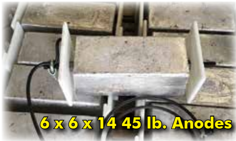
6 x 6 x 14 45 lb. Anodes