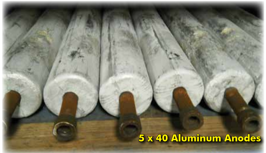
5 x 40 Aluminum Anodes