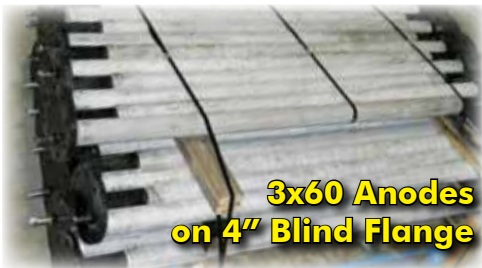
3x60 Anodes on 4" Blind Flange