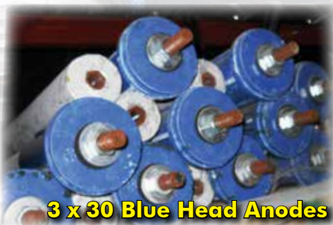
3 x 30 Blue Head Anodes