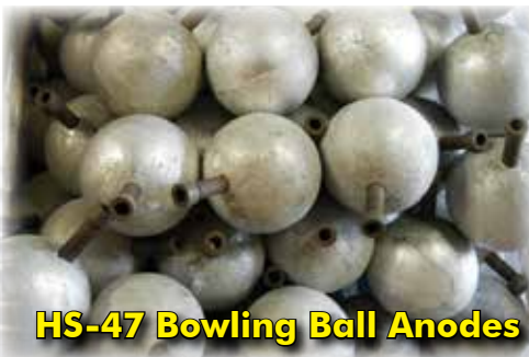
HS-47 Bowling Ball Anodes