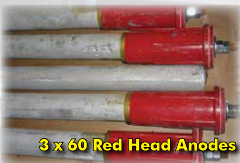
3 x 60 Red Head Anodes